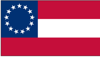
FIGURE 1. MARSCHALL, N. N.D. 'THE STARS AND BARS' (1861-63)

the flag (ibid.). Through the period of the Civil War the flag was seen by Southerners to have acquired layers of meaning like 'duty, soldierly valor [sic], ancestry, heritage, and tradition' (ibid. 27).