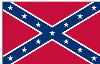
FIGURE 5. MILES, W. P. 1863 THE RECTANGULAR BATTLE FLAG OF THE ARMY OF TENNESSEE, CONFEDERATE STATES OF AMERICA ALSO CALLED THE CONFEDERATE FLAG, THE BATTLE FLAG, DIXIE FLAG, THE SOUTHERN CROSS.

https://en.wikipedia.org/wiki/File:Flag_of_the_Confederate_States_of_America_(1865).svg