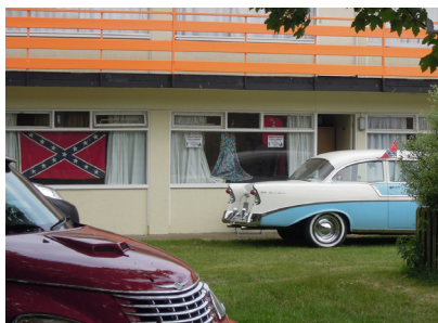
FIGURE 10. GLAVEY, P. 2018. CHALET WINDOWS AND VINTAGE CAR WITH FLAGS.