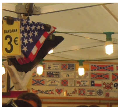
FIGURE 9. GLAVEY, P. 2017. BÉTHUNE STALL SELLING REBEL FLAG SEW-ON PATCHES