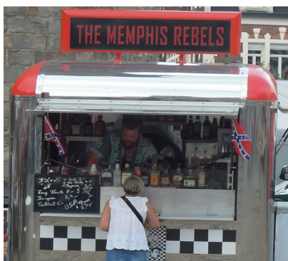
FIGURE 8. GLAVEY, P. 2017. BÉTHUNE DRINK SELLER WITH REBEL FLAGS