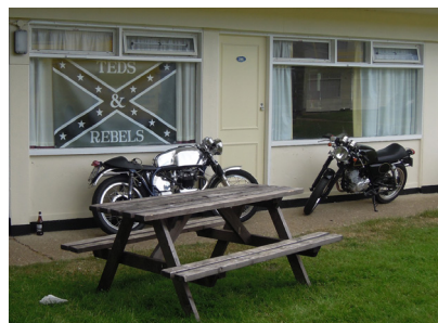
FIGURE 11. GLAVEY, P. 2018. CHALET WITH (GREYSCALE) FLAG.