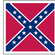
FIGURE 2. ARMY OF NORTHERN VIRGINIA BATTLE FLAG (1861)

https://en.wikipedia.org/wiki/File:Flag_of_the_Confederate_States_of_America_(1861-1863).svg