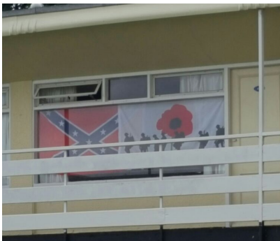
FIGURE 6. GLAVEY, P. 2016 FLAGS IN CHALET WINDOW AT ROCKABILLY RAVE

all of which centre on rockabilly and wider musical influences such as country and hillbilly. As the Rave is held at a seaside holiday park the chalet accommodation gives attendees an opportunity to decorate their temporary living spaces. There are frequent examples of the rebel flag pinned to front windows for the weekend. Some are in isolation, others paired with other flags, which add interesting connotative possibilities. One example from the past two years include rebel flags side by side with a pirate flag with a skull and bones and text reading 'The beatings will continue until morale improves'. Other examples include the rebel flag beside the Texan 'Come and Take it' flag, commemorating the Texan revolution of 1830s and the rebel flag beside a flag with a silhouette of line of 'Tommies', British soldiers in the 1 st World War on the background of a red poppy; the symbol of remembrance for that war (figure 6). Each of these combinations offers sets of signifiers that allow for a wide range of interpretation; from memorial, to resistance, to more overt celebration of Southern connection and politics. These examples and other instances of rebel flag patches on attendees clothing could simply fit with the tradition of the flag as marker of 'Southernness' and connecting to the music and the event through this geographic and symbolic reference.